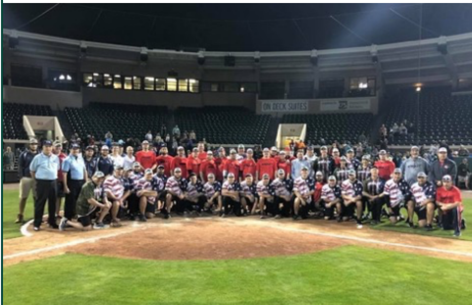
Spring Training 2018 - WWAST vs. Publix All-Stars