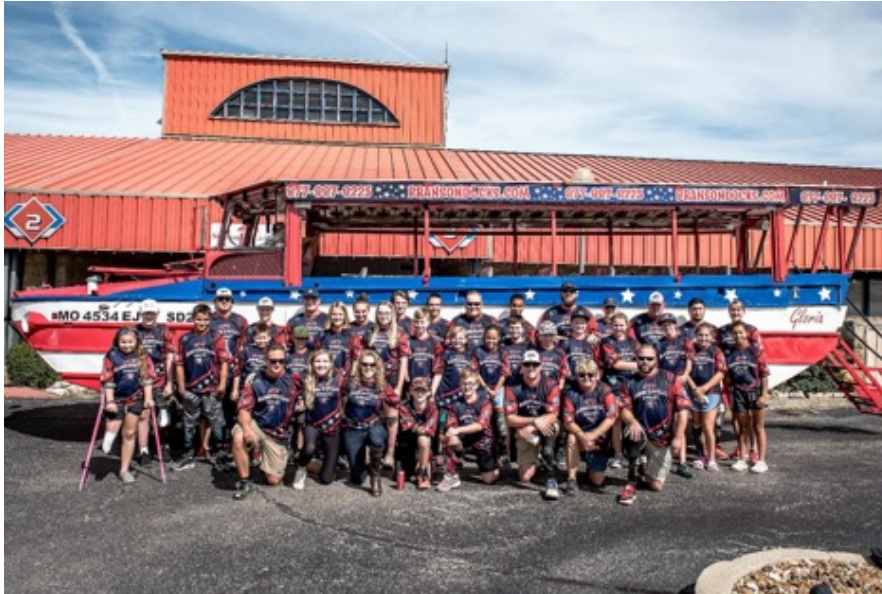
WWAST Players and Kids Alumni Kids Camp in Branson, MO