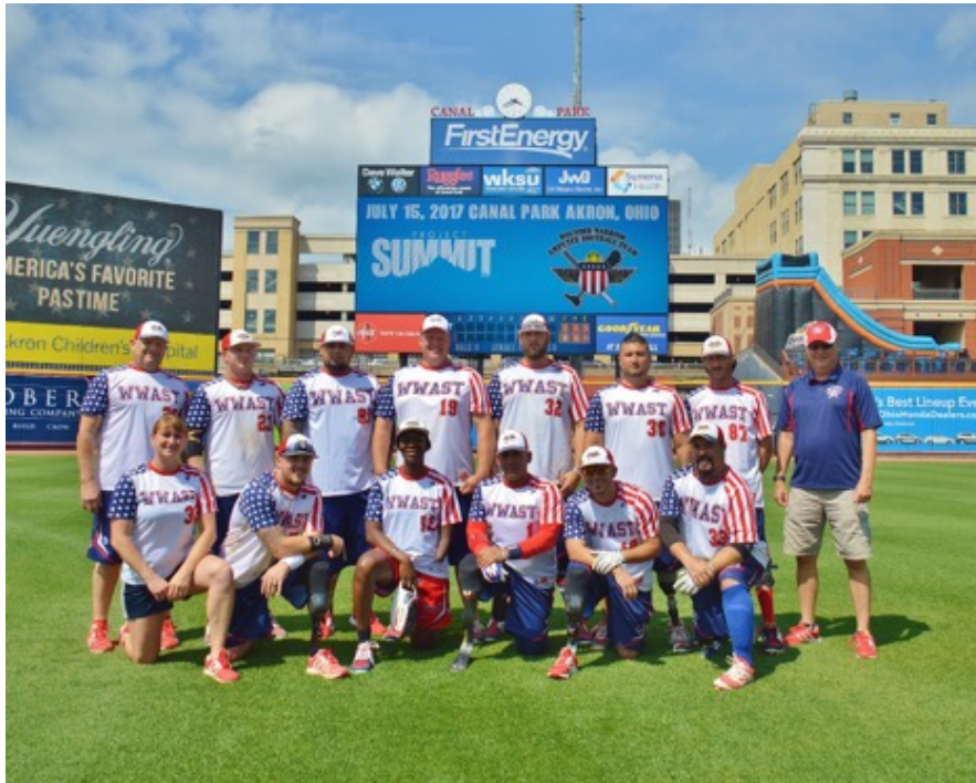
WWAST Players at Canal Park in Akron, Ohio on July 15, 2017