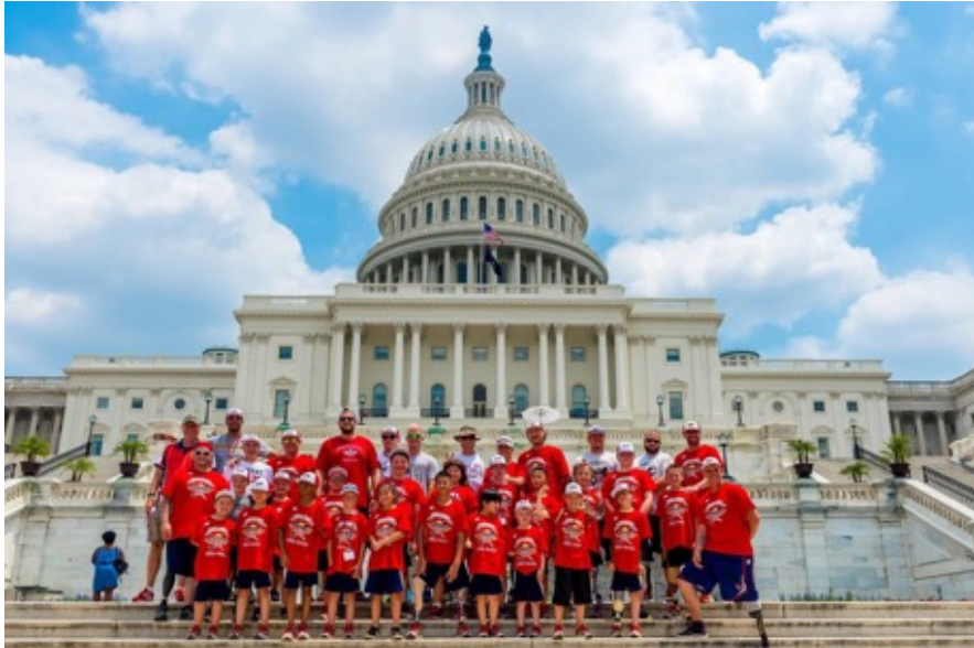
WWAST Players and Kids at U.S. Capitol during the WWAST Kids Camp in Fairfax, VA - June 12-18, 2017